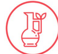
Oils & fats