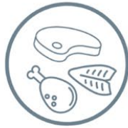
Meat, tofu, poultry & fish