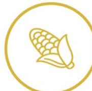
Corn cobs & husks