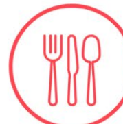
Most "compostable" plastics