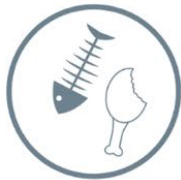
Poultry & fish bones