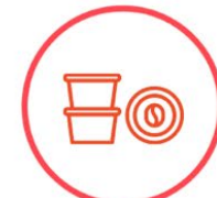
Most "compostable" coffee pods