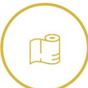
A small amount of paper towel/tissue