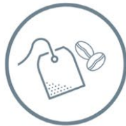
Coffee grinds (incl. filters), tea leaves & teabags