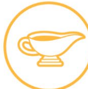
Sauces, dressings & gravies