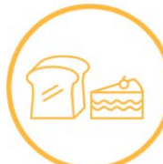
Starches (bread, cake, rice)