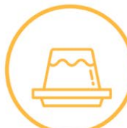
Jellies & jams, puddings