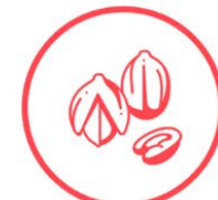
Hard pits (incl. peach, nectarine, apricot, lychee & mango)