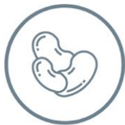
Beans, seeds & legumes