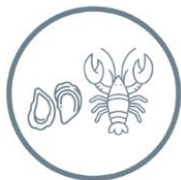
Shellfish (incl. shells)