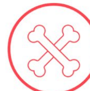
Beef, pork & lamb bones