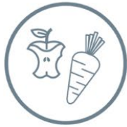
Most vegetable & fruit scraps