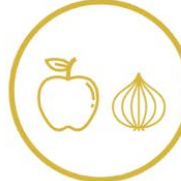
Whole fruits and vegetables