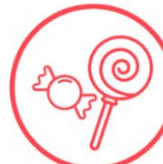
Candy & gum