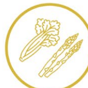
Celery, asparagus & other fibrous plants