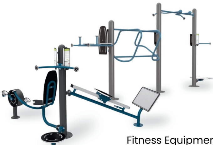
Fitness Equipment example only

These upgrades support the Township's Multi-Year Accessibility Plan and commitment to creating inclusive, barrier-free community spaces that encourage active living and social connection.