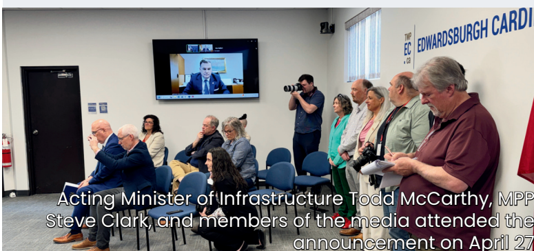
Acting Minister of Infrastructure Todd McCarthy, MPP Steve Clark, and members of the media attended the announcement on April 27

The company has experienced significant recent growth, increasing its workforce from 95 to approximately 125 employees since November 2025. It anticipates hiring an additional 10 to 20 employees in the coming months, along with additional on-site contractors, as it continues to respond to increased demand and investment in Canada's defence sector.